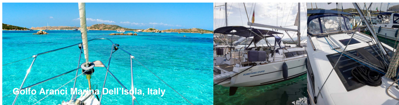
Golfo Aranci Marina Dell'Isola, Italy