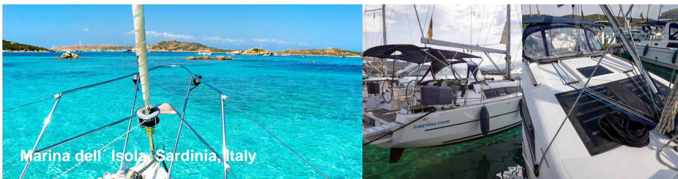
Marina dell' Isola Sardinia, Italy