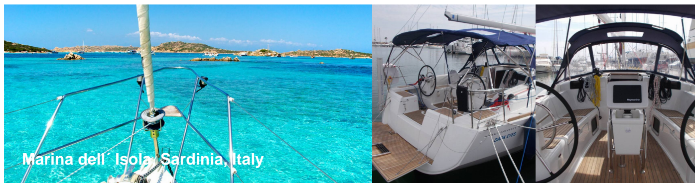
Marina dell' Isola Sardinia, Italy