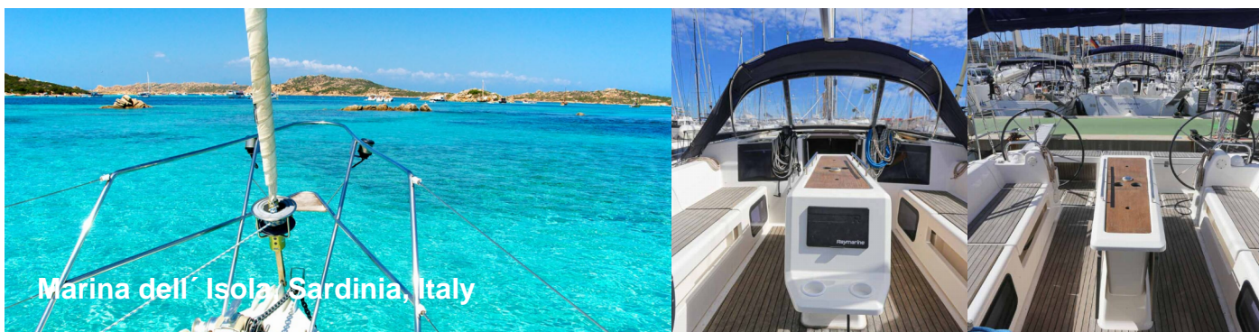
Marina dell' Isola Sardinia, Italy