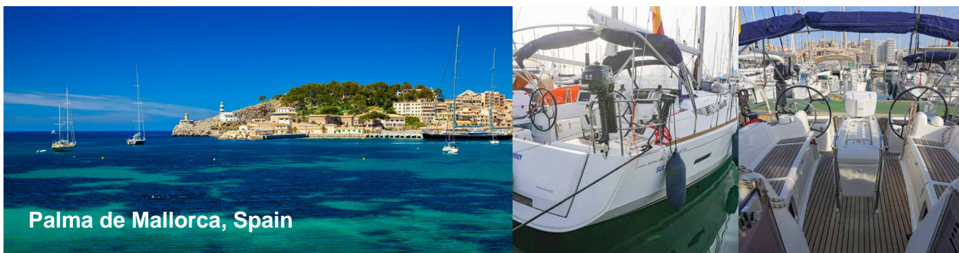
Palma de Mallorca, Spain