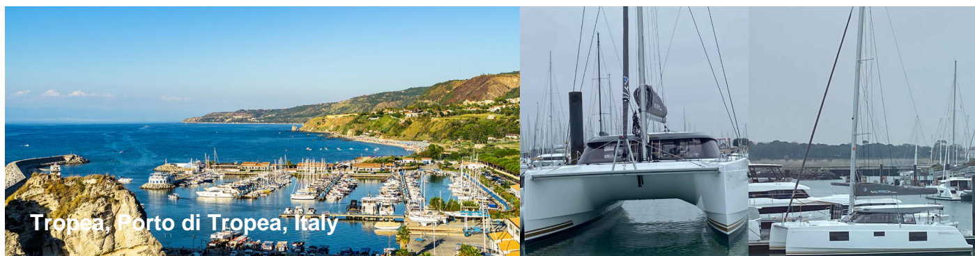
Tropea, Porto di Tropea, Italy