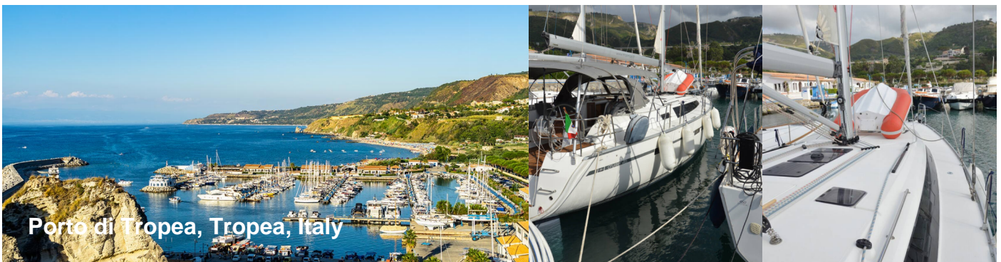
Porto di Tropea, Tropea, Italy