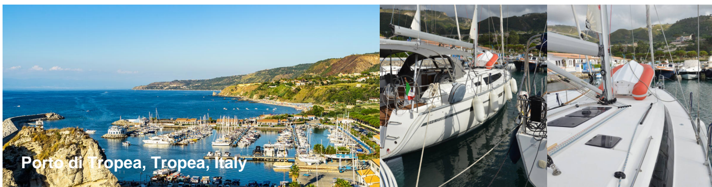
Porto di Tropea, Tropea, Italy