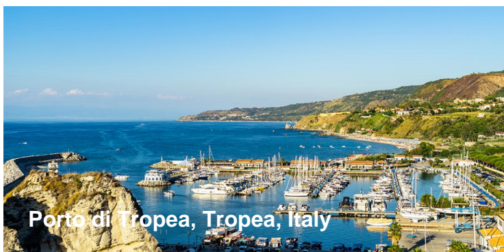
Porto di Tropea, Tropea, Italy