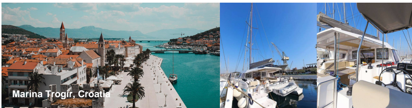
Marina Trogir, Croatia