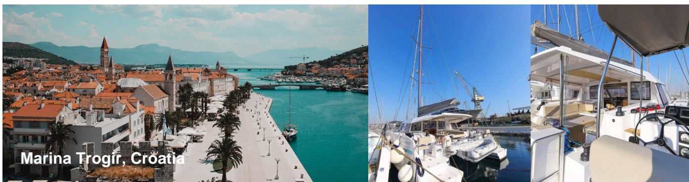
Marina Trogir, Croatia