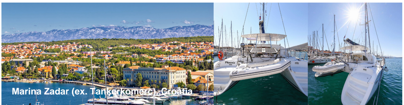
Marina Zadar (ex. Tankerkomerc), Croatia