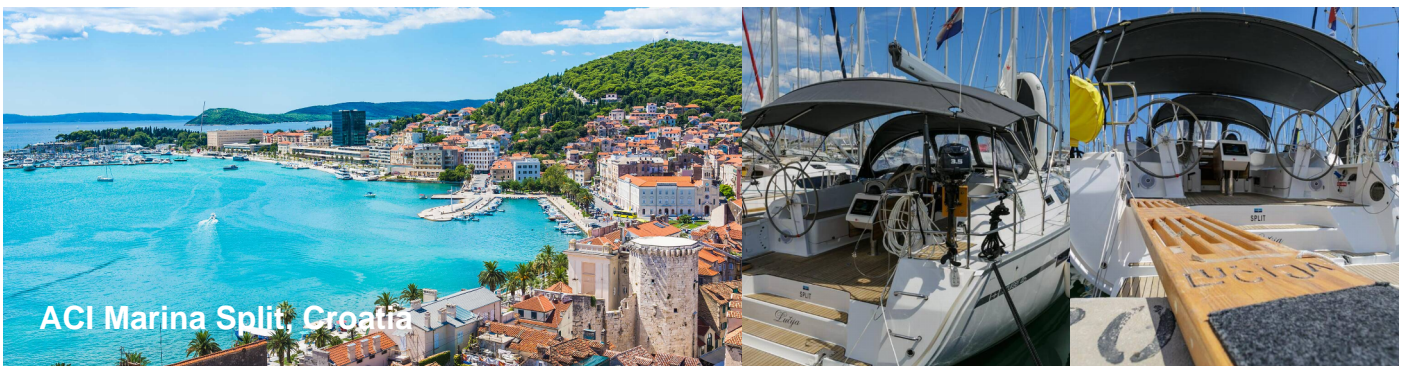
ACI Marina Split, Croatia