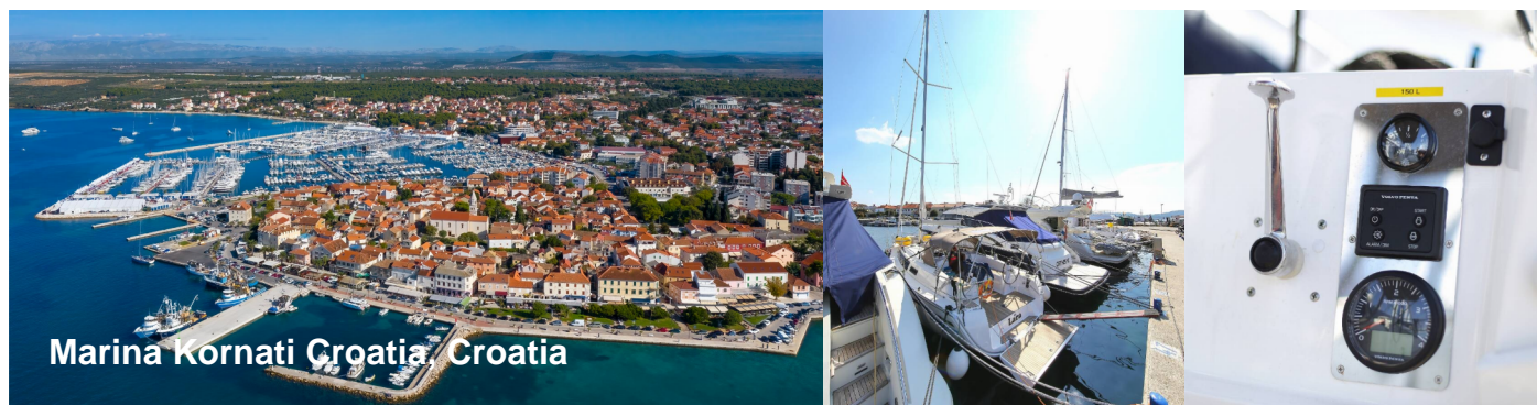
Marina Kornati Croatia Croatia