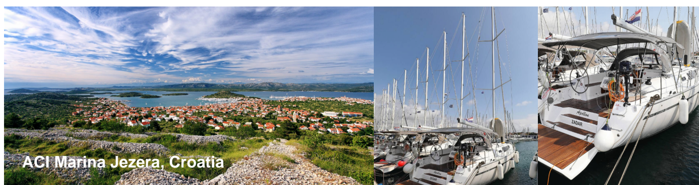
ACI Marina Jezera, Croatia