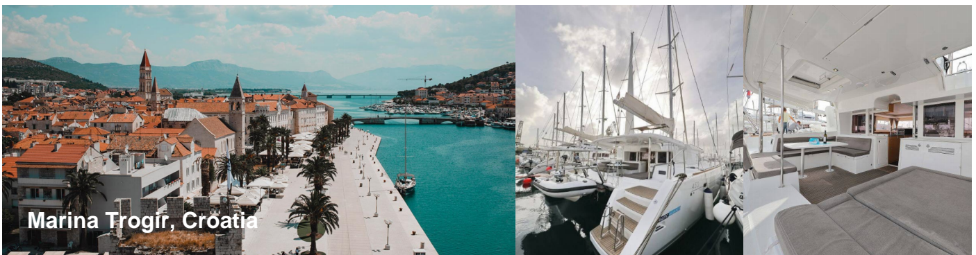
Marina Trogir, Croatia