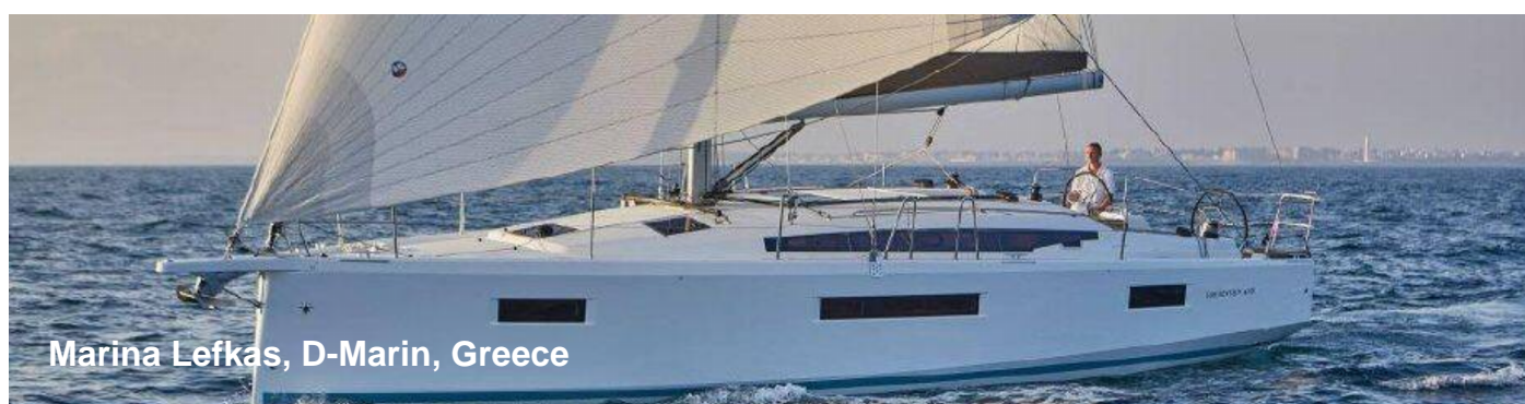
Marina Lefkas, D-Marin, Greece