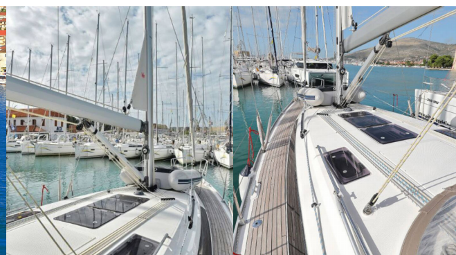
Marina Trogir - ACI, Croatia