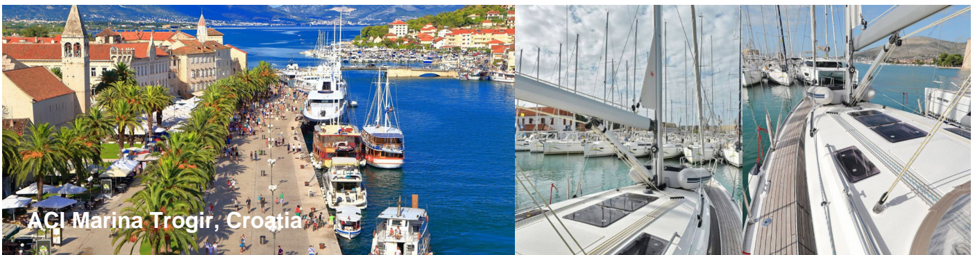
ACI Marina Trogir, Croatia