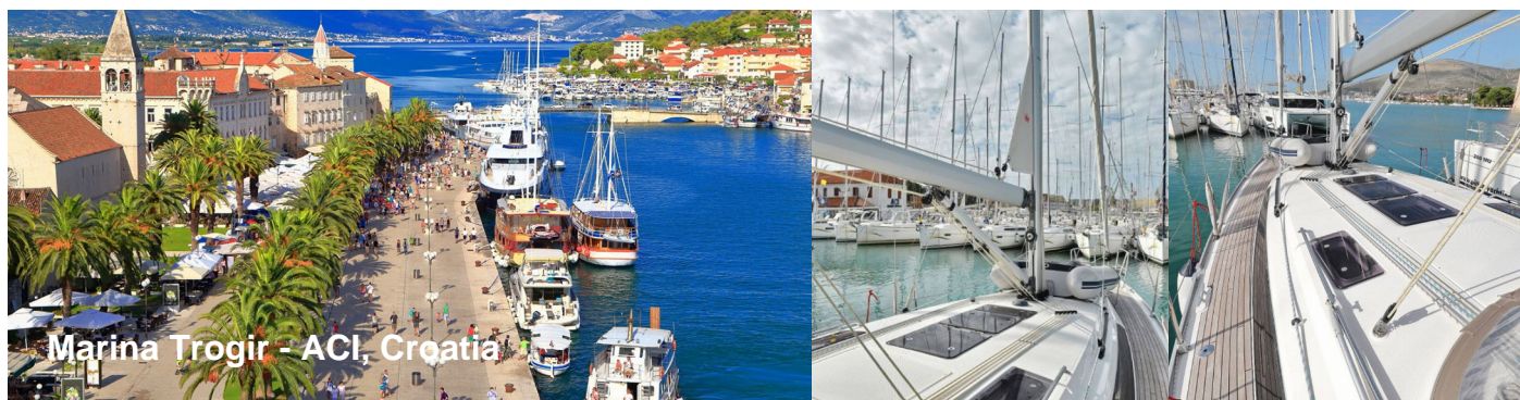
Marina Trogir - ACI, Croatia