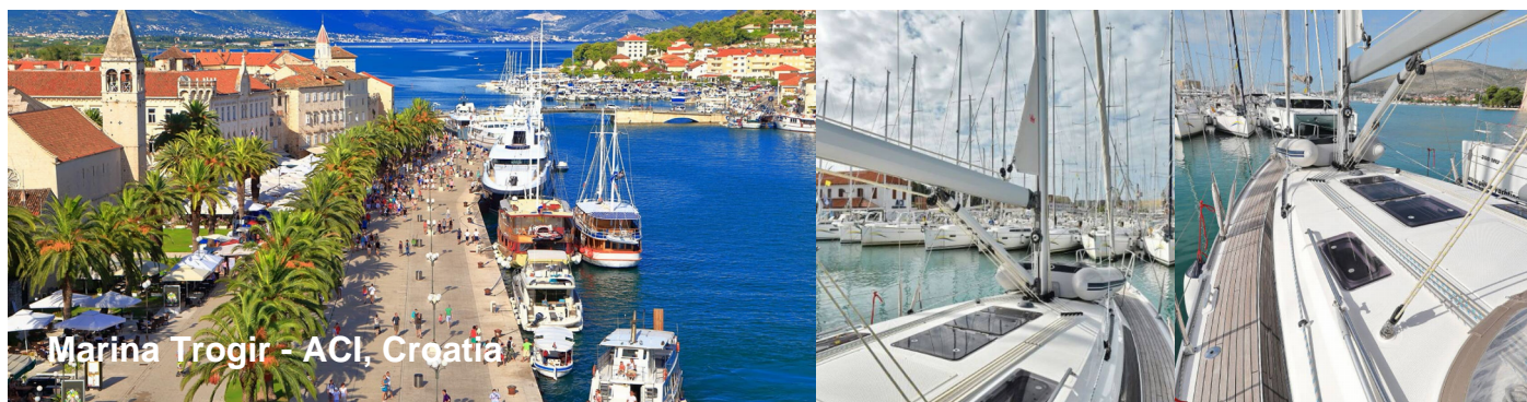
Marina Trogir - ACI, Croatia