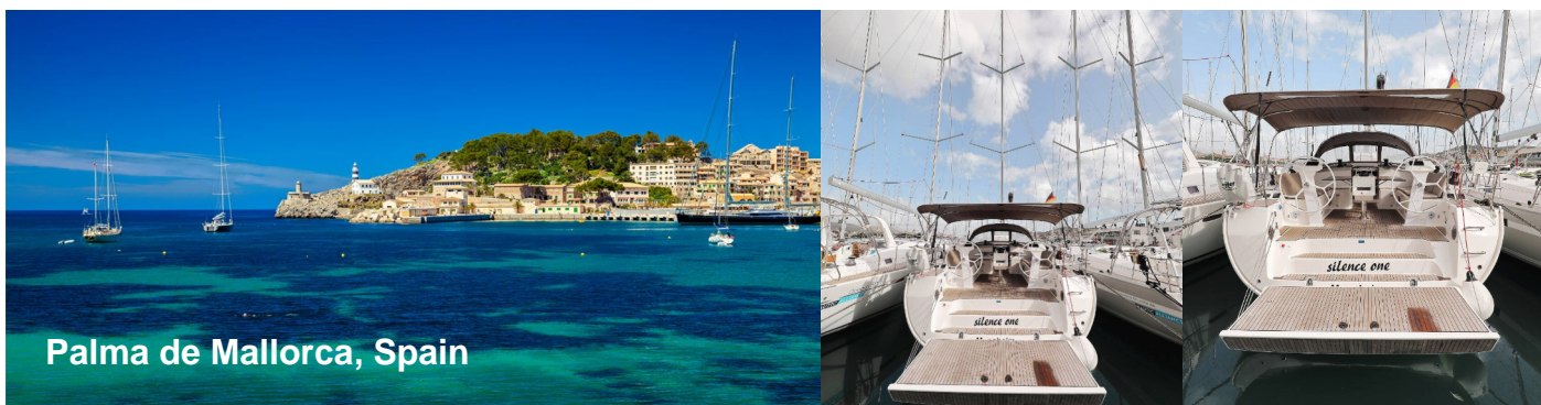
Palma de Mallorca, Spain