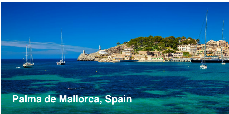
Palma de Mallorca, Spain