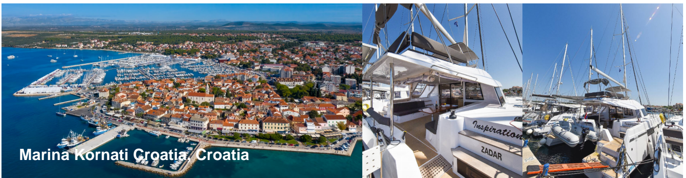
Marina Kornati Croatia Croatia