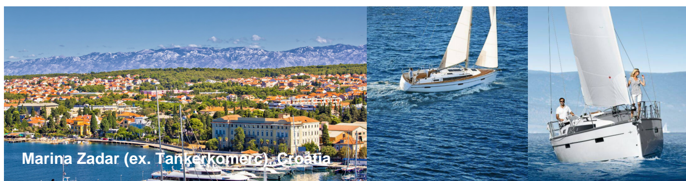
Marina Zadar (ex. Tankerkomerc), Croatia