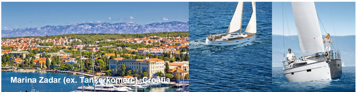
Marina Zadar (ex. Tanjerkomerac), Croatia