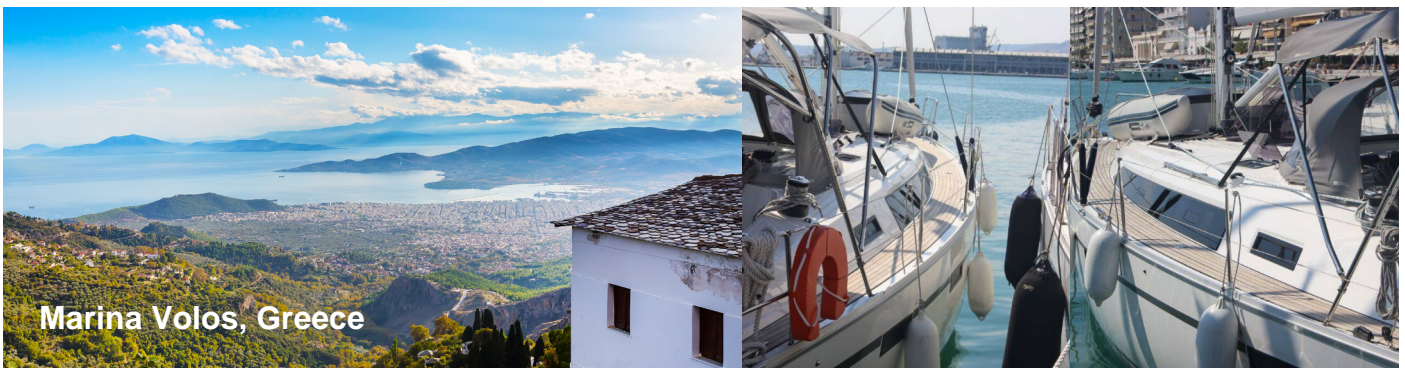
Marina Volos, Greece