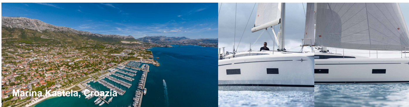
Marina Kastela, Croazia